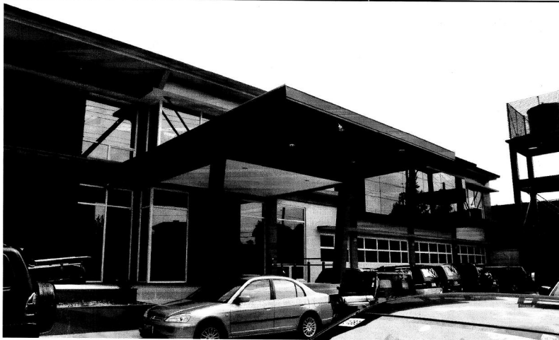
1 PERSPECTIVE SCALE NTS